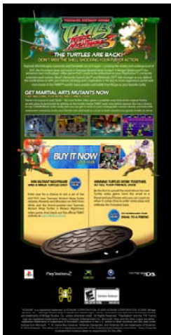
Turtles (Video Game, Cartoon, Motion Picture)

ANG built deeper, ongoing relationships with fans (CRM): ANG built newsletters that engaged customers with relevant information, contests and features that have tripled newsletter subscription base to date: