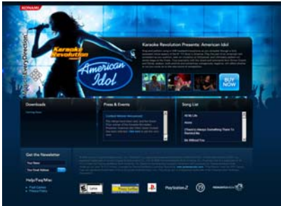
Music in Every Direction (Portal for Dance & Music Games)

Microsites: Examples of differentiated micro-sites designed to address different customers needs and market expectations: