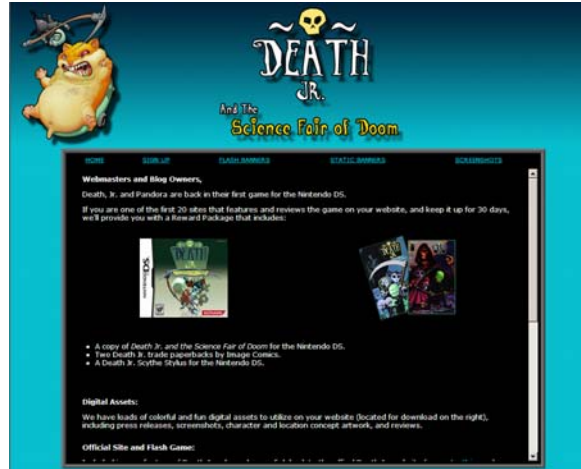
Death Jr. (Influencer Marketing Campaign – Partner Page)