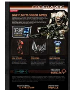
Coded Arms (First-person Shooter Video Game for Sony PSP platform)