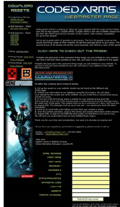
Coded Arms (Influencer Marketing Campaign)

...developed "out-of-the-box" marketing ideas that included enlisting key influencers such as Bloggers, Columnists and Editors to evangelize and promote new releases. These partnerships were achieved via promotional tie-ins and exclusive content offerings.