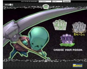
Death Jr. (Cult Video Game Series & Sony Motion Picture)

ANG built deeper, ongoing relationships with fans (CRM): ANG built newsletters that engaged customers with relevant information, contests and features that have tripled newsletter subscription base to date: