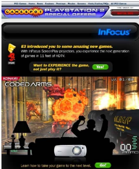
Coded Arms (Partnership with GameSpot, Infocus and Konami)