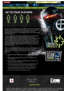
Coded Arms (First-person Shooter Video Game for Sony PSP platform)