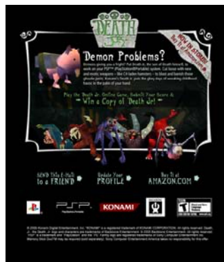
Death Jr. (Cult Video Game Series & Sony Motion Picture)